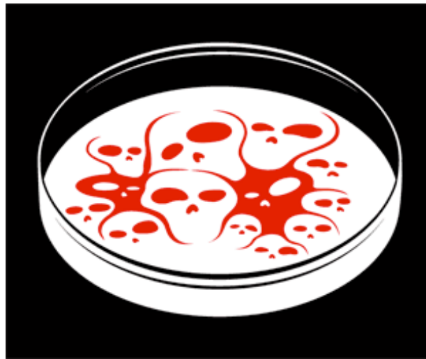
Illustration by Noma Bar

The stem-cell hypothesis has also changed the way people do basic research. For example, over the past few years cancer researchers have been grinding up pieces of tumour and using what are known as gene-expression microarrays to work out which genes are active in them. However, if the hypothesis is correct, this approach will probably yield the wrong result, because the crucial cells make up but a small part of a tumour's bulk and the activity of their genes will be swamped by that of the genes of the more common non-stem cells. The answer is to isolate the stem cells before the grinding starts.