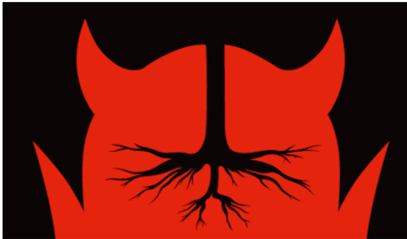
Illustration by Noma Bar