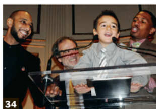
Oct. 10: Children's Rights, an advocacy group that works to reform failing child-welfare systems across the country, held an awards dinner at the Plaza. The 350 guests raised $500,000.