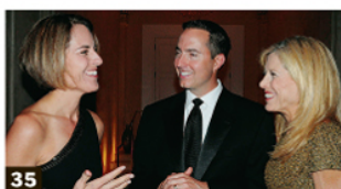
Oct. 9: The Skin Cancer Foundation had its benefit at the Plaza, with dinner and a program in the Grand Ballroom.