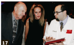
Oct. 9: The New York Stem Cell Foundation held its annual benefit at the Time Warner Center.