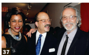
Oct. 10: The Harlem School of the Arts had a benefit at Lincoln Center, honoring the musician Herb Alpert for his $6 million donation to the organization.