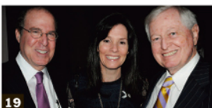
Oct. 11: The Melanoma Research Foundation presented its awards dinner at Gotham Hall.