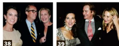
Oct. 9: The Museum of the City of New York held an awards reception at the Four Seasons restaurant.