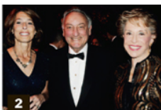
Oct. 10: The New York-Presbyterian/Weill Cornell Medical Center held a benefit cabaret at the Park Avenue Armory. The event, which attracted 850 guests, raised $2.5 million for the hospital.