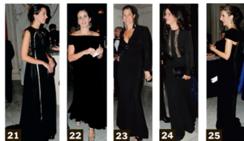
Oct. 11: The Hispanic Society of America, founded in 1904 off Broadway near 155th Street, held a dinner-dance at the Metropolitan Club. The society, founded in 1904 by the philanthropist Archer M. Huntington to promote the study of the arts and culture of Spain and its influence in Latin America and the world, has important works by Goya, Velázquez, El Greco and Sorolla.