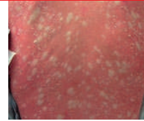
THE SKIN DISEASE THAT CURES ITSELF Diseased cells harness cancer-causing mechanism. go.nature.com/ZJUEQS